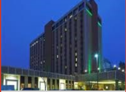
February 27—March 3, 2017 Holiday Inn Capitol Plaza, Sacramento, CA